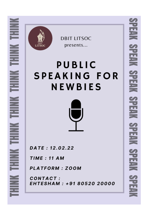
Public Speaking for Newbies Poster